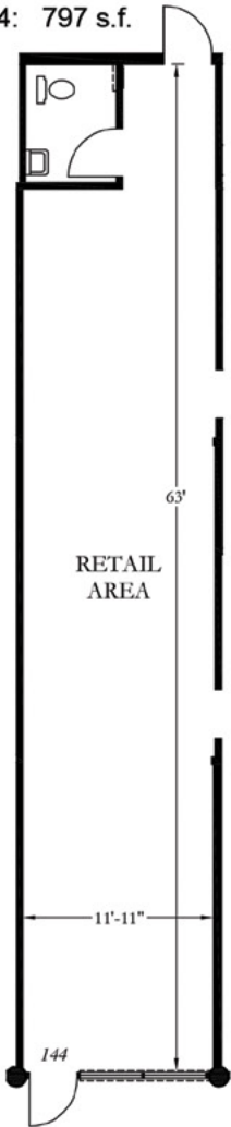
Suite 144: 797 s.f.